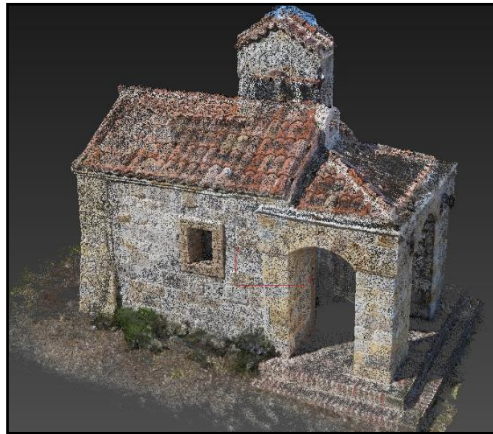
Fig. 3. Example of a laser scanning result – point cloud

The key “BIM technology” in relation to the generation of BIM models of not only historic buildings is laser scanning. It is a process in which we obtain accurate information about the scanned object by means of determining its spatial coordinates. Individual points carry information based mostly on the principle of the spatial polar method. Hence, each point is identified by the oblique length, the horizontal angle, the zenith angle, and it can also carry the colour shade value. The result is a point cloud that is transformed into a BIM model (sample output in the Fig. 3).