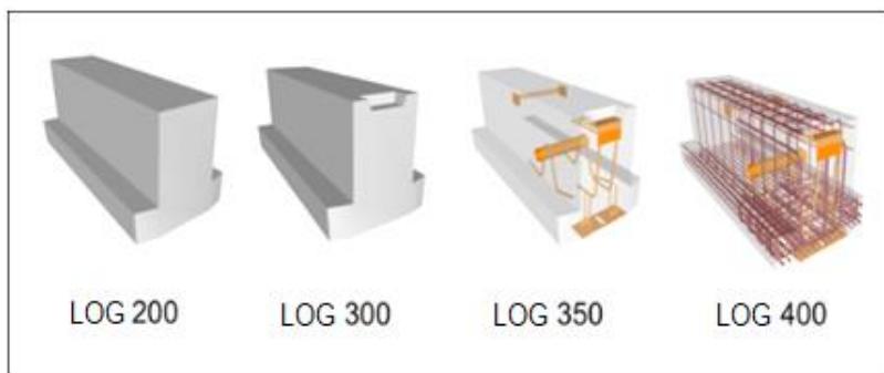
Fig. 4 Example of graphical information levels of detail in LOG

Graphical information specifies the type of drawing, graphics, location in space, scale, shape, etc. In the case of requirements for graphical data, due to the absence of national standards, most creators of “BIM data” usually refer to the international method of marking the graphical levels according to the Level of Geometry (LOG) method. LOG determines the geometric level of detail of the BIM model or its individual elements (structures/technologies processed in the virtual environment) for various phases of the project documentation, and thus defines which parts of structures/technologies should be drawn in the model and which should not. The scale is usually from LOG 100 to LOG 400 (for an example of a model structure see the figure below - Fig. 4), where the detail of the documentation for the building permit is recommended at the LOG 300 level, while for the documentation for the construction process and building passports, the recommended version of detail is LOG 350.